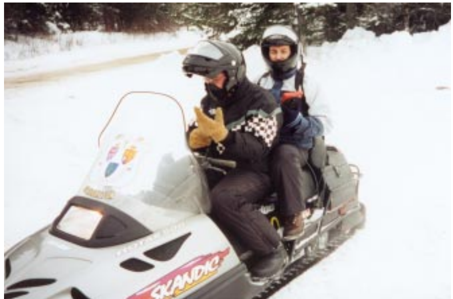
The City of Fredericton staff maps snow mobile trails using a Leica GS50 GPS/GIS receiver.

One of the many benefits the City of Fredericton has realized from using the Leica GS50 GPS/GIS receiver is quick turnaround time for data collection.