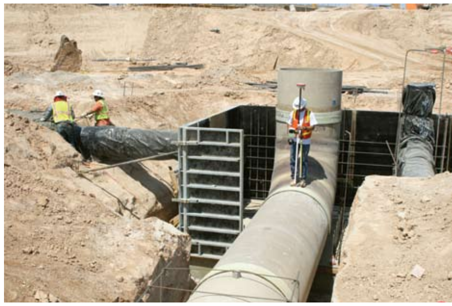
Collecting an as-built shot on the center line of a 54-inch sewer pipe requires careful footwork.