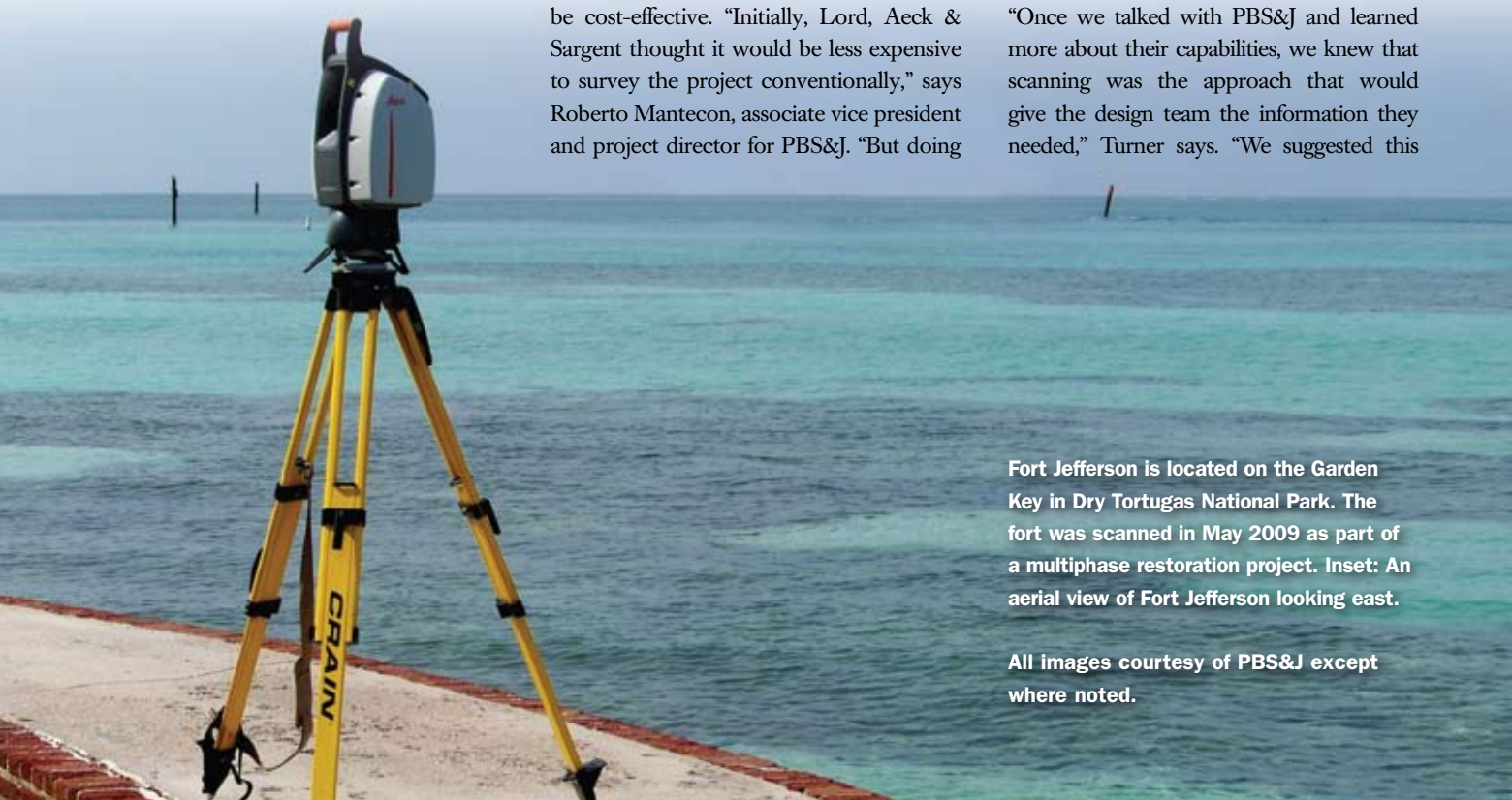
Fort Jefferson is located on the Garden Key in Dry Tortugas National Park. The fort was scanned in May 2009 as part of a multiphase restoration project. Inset: An aerial view of Fort Jefferson looking east.